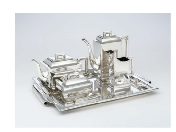
Gallery 228—Second Floor

Tea and Coffee Service (7 piece), circa 1930, Emmy Roth (German, 1885–1942), silver and ivory, Museum Purchase: Decorative Arts Deaccession Fund and Cincinnati Art Museum Women's Committee, 2017.62a–g