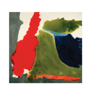
Gallery 231—Second Floor

Helen Frankenthaler (American, 1928–2011), Rock Pond, 1962–63, acrylic on canvas, The Edwin and Virginia Irwin Memorial, 1969.11, © 2016 Helen Frankenthaler Foundation, Inc. / Artists Rights Society (ARS), NY