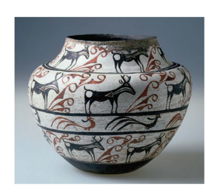
Gallery 216—Second Floor

Zuni Artist (American, late 19th century), Polychrome Jar, circa 1875, earthenware with white slip and pigments, Gift of the Women's Art Museum Association, 1885.48