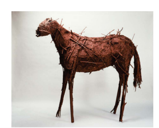
Gallery 105—First Floor

Deborah Butterfield (American, b. 1949), Horse No. 1, 1983, red mud, sticks, metal armature, Henry Meis Endowment and various funds, 1984.94, © Deborah Butterfield/Licensed by VAGA at Artists Rights Society (ARS), NY