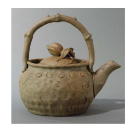
Gallery 151—First Floor

Rengetsu Ōtagaki 太田垣 蓮月 (1791 – 1875), Teapots, 19th Century; circa 1875, ceramic, Japan, Gift of the Rookwood Pottery, 1898.27-28