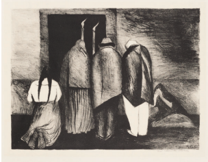
José Clemente Orozco (Mexican, 1883–1949), El Requiem (Requiem) , 1928, lithograph, Gift of Herbert Greer French, 1940.410, © 2016 Artists Rights Society (ARS), New York / SOMAAP, Mexico City