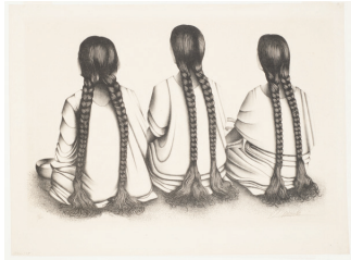
Francisco Dosamantes (Mexican, 1911–1986), Women of Oaxaca (Seated) , 1940s, lithograph, Gift of Emily Poole, 1942.139