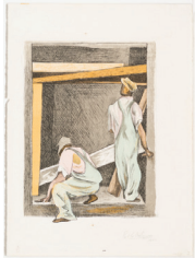
Pablo O’Higgins (Mexican, 1904–1983), Masons , 1942, color lithograph, Museum Purchase, 1948.31