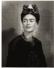
Bernard Silberstein (American, 1905–1999), Frida Kahlo, circa 1940, printed 1984, gelatin silver print, Museum Purchase, 1986.580