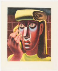
Emilio Amero, (Mexican, 1901–1976), The Gesture , color lithograph, Museum Purchase, 1950.12